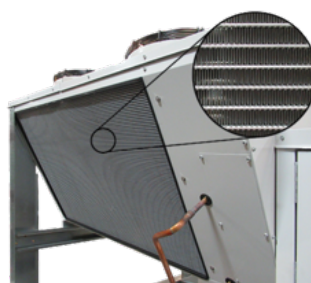
Microchannel Condenser Coils